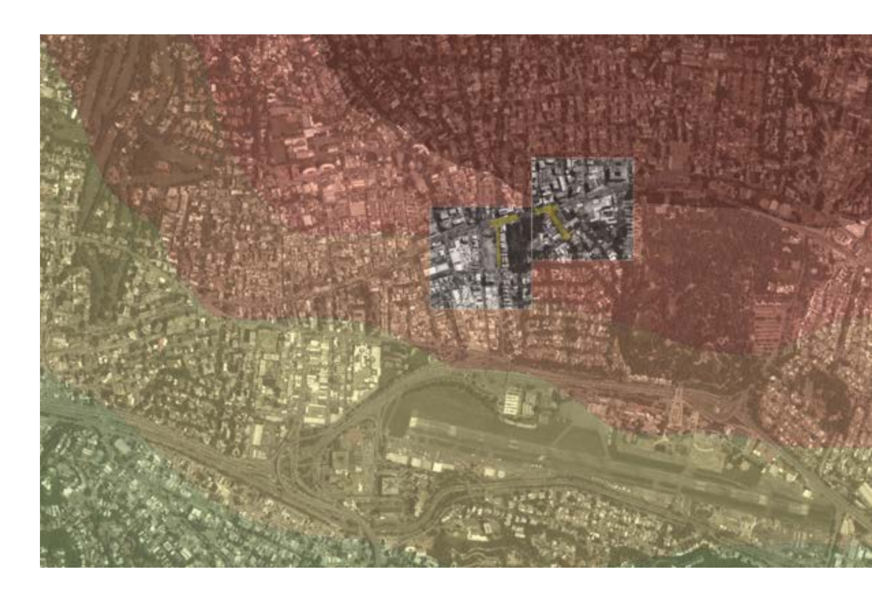
Image 2. Map indicating the area most susceptible to earthquakes around one of the locations selected for the "Concurso de Provectos Participativos en el Espacio Público" (Altamira, La Floresta, Hotel Monserrat, Ministerio del Poder Popular para el Turismo, Colegio Universitario de Caracas). Darker colors show more susceptible areas and dashed lines underline the specific sites. Based on the sector's soil and previous events. Image by the authors of the contest's proposal, edited starting from: Google Earth, earth.google.com/web.

Among the vulnerabilities that are generally discussed in relation to earthquakes, it is necessary to highlight that almost half of the population of the capital lives in slums